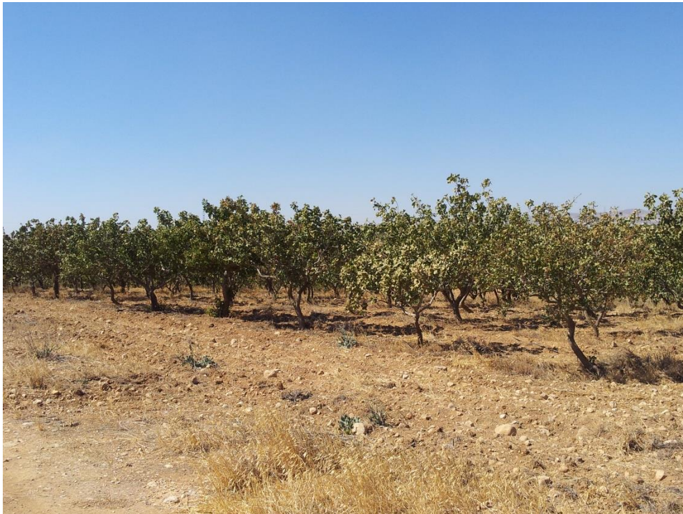
Pistachio trees on JUST campus

https://earth.google.com/web/@32.48551095,36.00694366,570.79206938a,15829.36139182d,30.0000056y,-0h,0t,0r